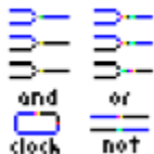
Spiral Demon Computer Components

AutoCell 2.0 offers a large, variable field, drawing, editing and zooming tools, sophisticated document handling, a 256 color palette, and a user-friendly interface.